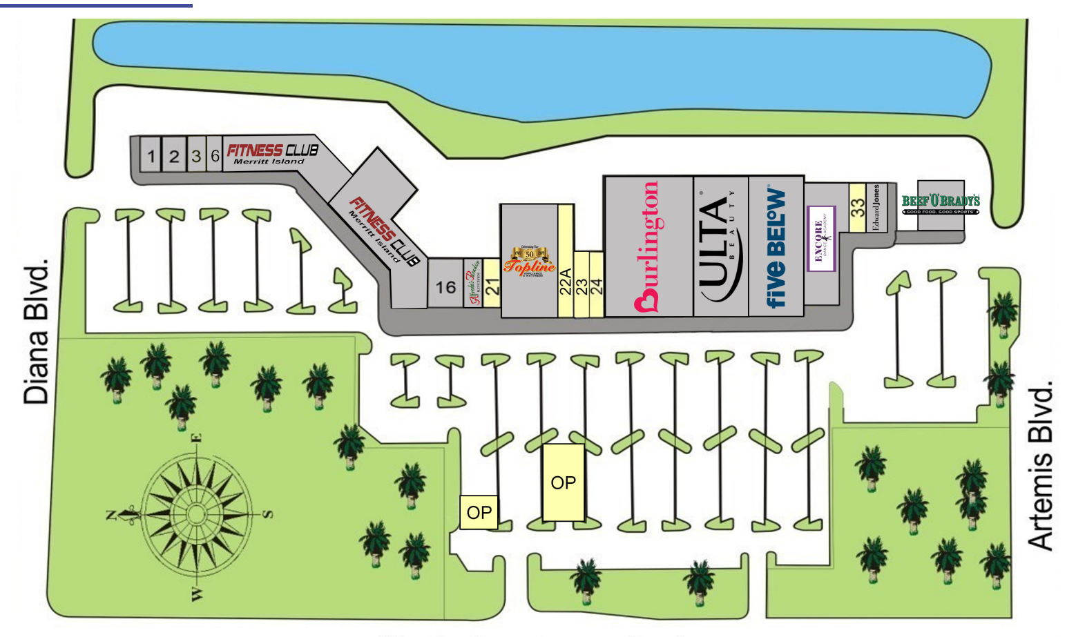
North Courtenay Parkway